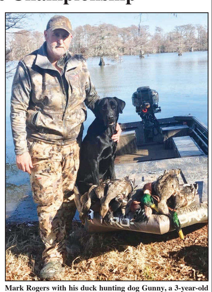
black Labrador, along with their catch of the day.