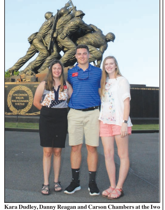
Jima Memorial near Washington D.C. last summer. This week marks the 74th anniversary of the start of the Battle of Iwo

Currently, the fixed charge portion of each residential customer's bill, aka the customer charge, is right at $21.37. See EMC, Page 2A