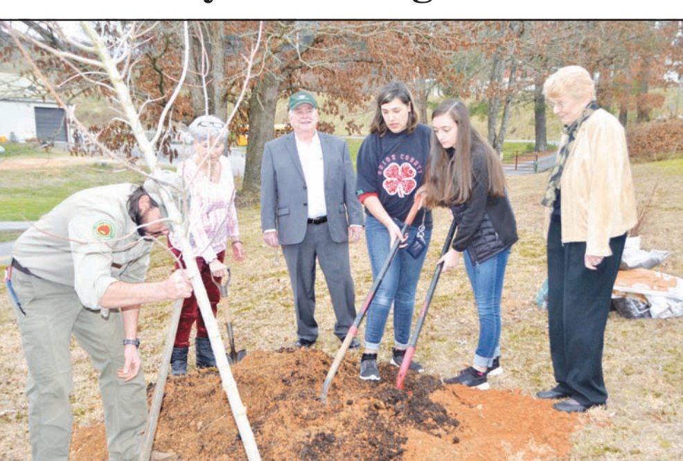
The planting of a new tree commemorating Arbor Day on Friday, Feb. 15, at the Old Blairsville